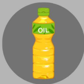
OIL & DRESSING