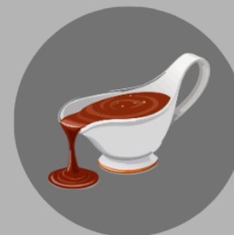
SAUCE & GRAVY